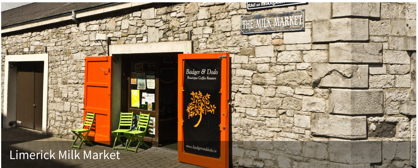
Limerick Milk Market

southwest Ireland, so we wanted to give you the chance to see it for yourself on a guided walking tour. You'll feel as though you've stepped into Camelot, prepared for King Arthur to emerge at any moment from the great hall. Whispers of political intrigue and romance, and images of lost treasure and knights in chain mail may come to mind.