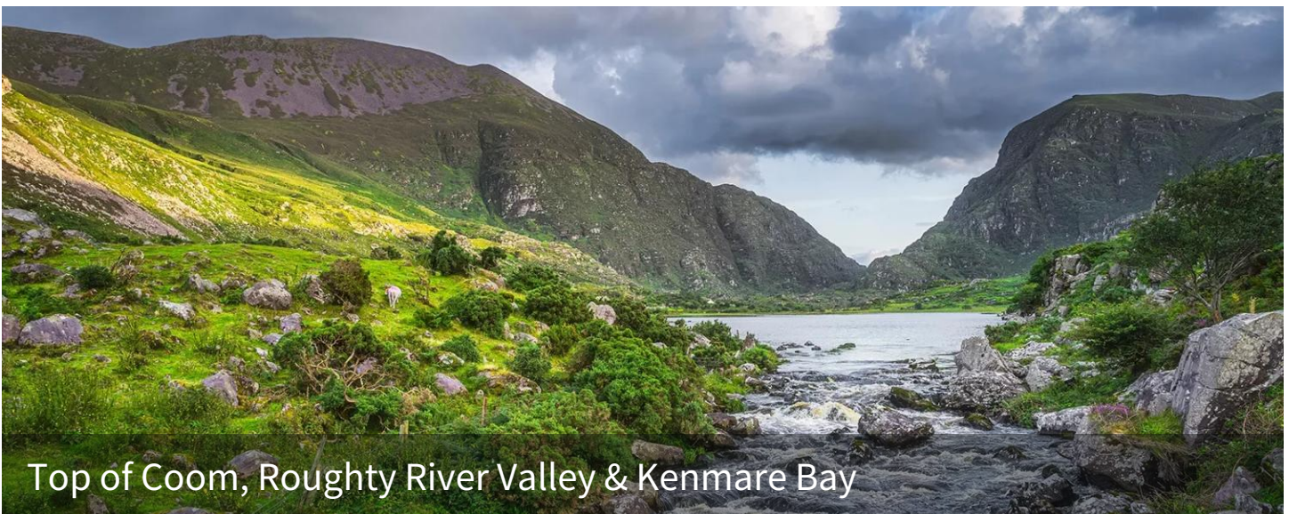
Top of Coom, Roughty River Valley & Kenmare Bay