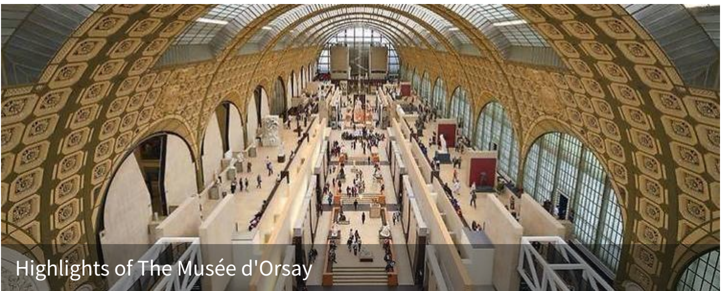
Highlights of The Musée d'Orsay

Follow your guide through the museum's collection of Impressionist paintings, the biggest in the world, and discover masterpieces of artists such as Monet, Renoir, Van Gogh, Pissarro, Degas and many more. You will also see the original model of the Statue of Liberty as well as sculptures by Rodin. To help keep the children engaged and entertained throughout this 2-hour visit, they will each get a game booklets, helping them learn about Impressionism as much as they have fun.