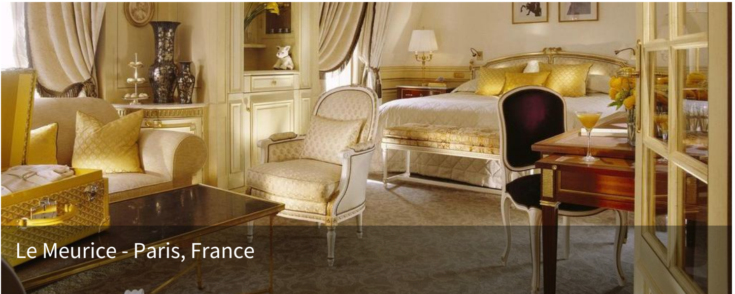
Le Meurice - Paris, France