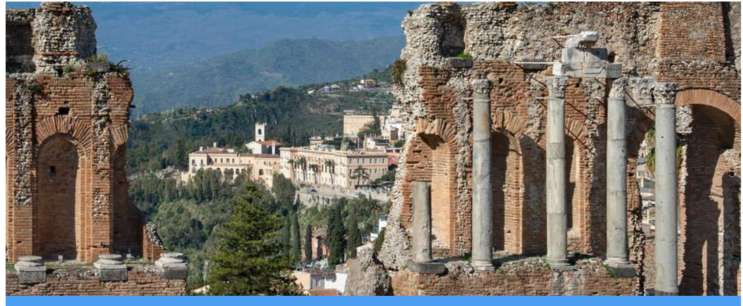
3 Days Itinerary