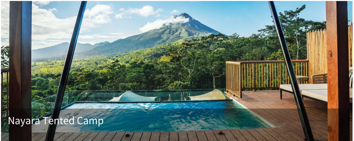
Nayara Tented Camp