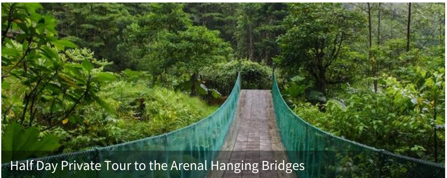
Half Day Private Tour to the Arenal Hanging Bridges