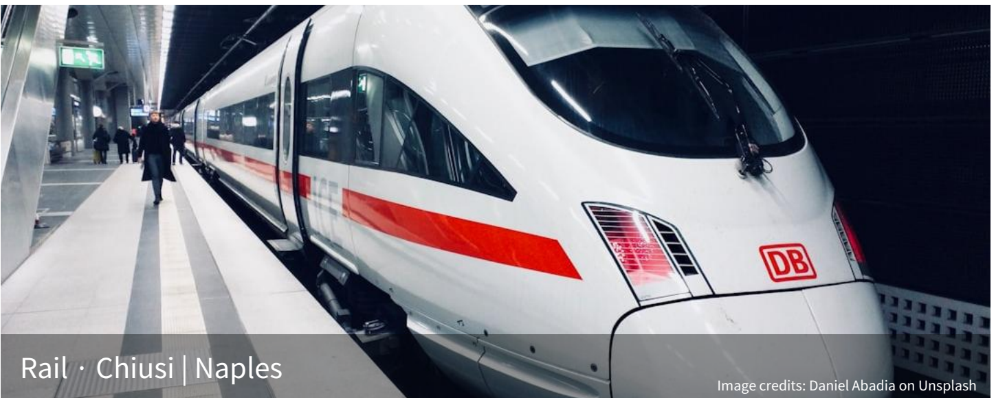
Rail · Chiusi | Naples