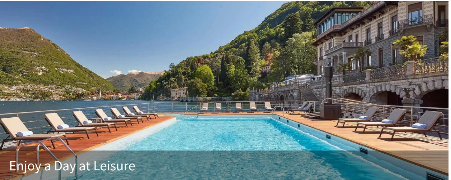
Enjoy a Day at Leisure