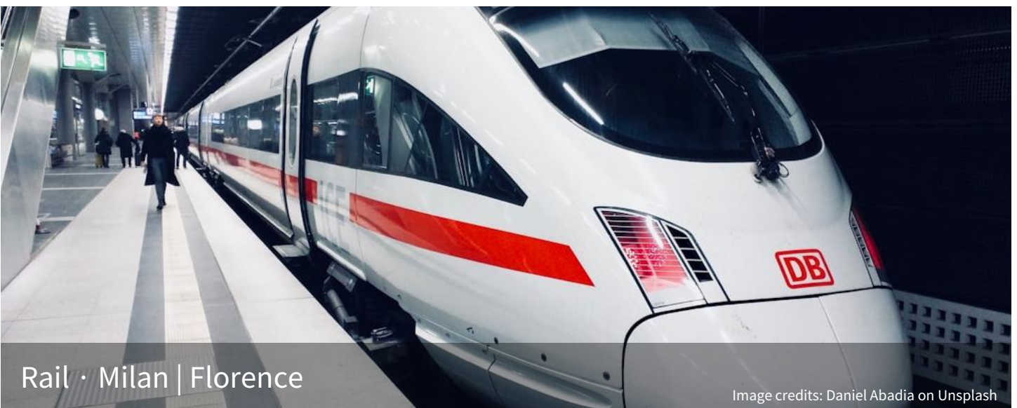
Rail · Milan | Florence