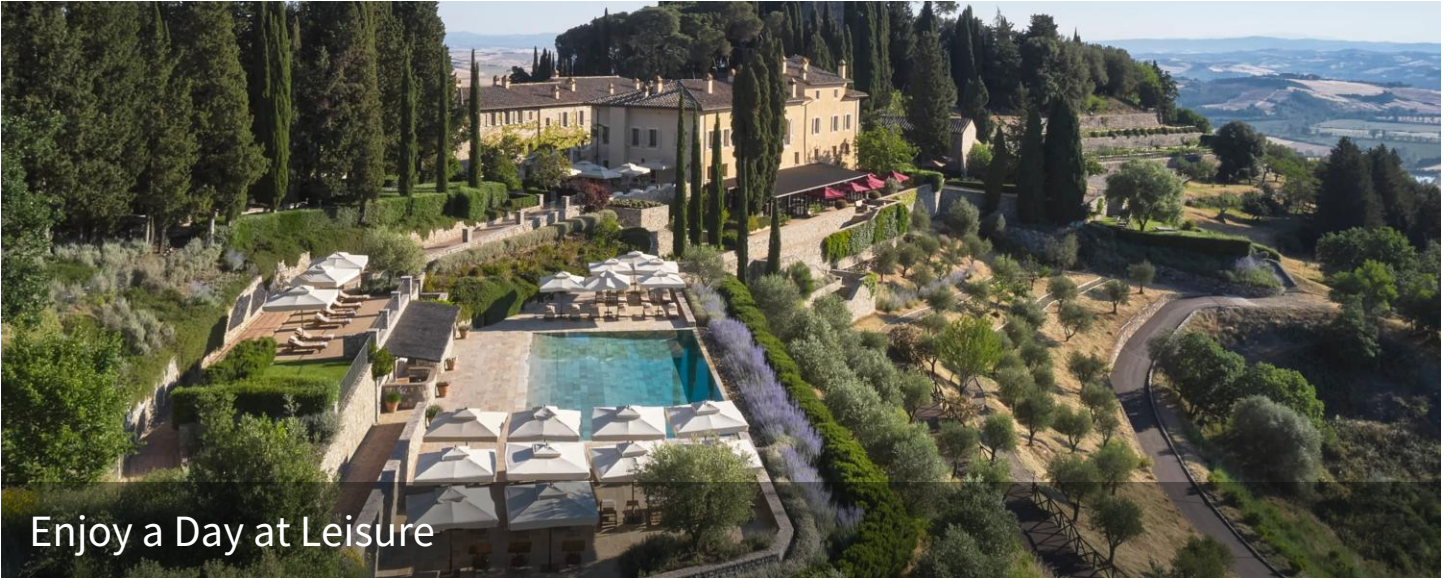
Enjoy a Day at Leisure