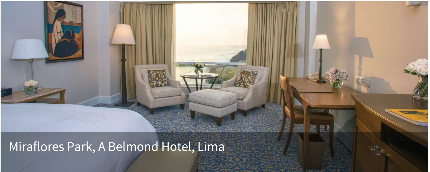
Miraflores Park, A Belmond Hotel, Lima