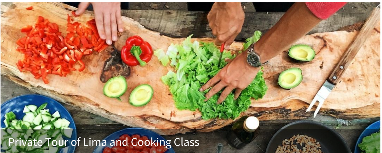
Private Tour of Lima and Cooking Class