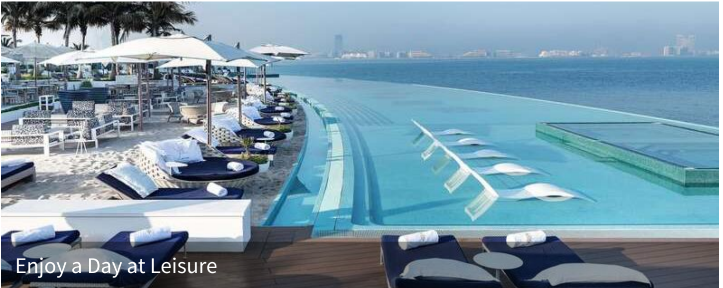
Enjoy a Day at Leisure