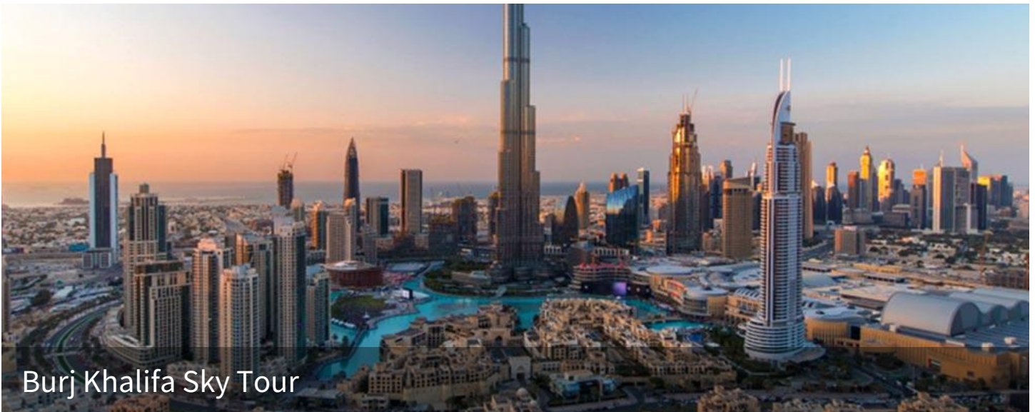
Burj Khalifa Sky Tour

Dubai offers visitors a myriad Experience from the unforgettable charms of the traditional souks to inspiring imposing Skyscrapers. Our journey starts at the world's tallest building, 'Burj Khalifa', situated above The Dubai Mall one of the world's largest shopping malls. Our journey continues to Dubai Marina and Palm Jumeirah, a manmade island that has become a potent symbol of our Emirate. We will have a photo stop opposite the ultra-luxurious Atlantis, The Palm hotel. Your unforgettable journey will continue at Souk Madinat Jumeirah, a colorful and vibrant market in an Arabian city. We continue passing the world trade Centre of Dubai along the 2nd December Street to the union house, an edifice reminder of the bravery of the grand fathers and their decision and commitment to create the United Arab Emirates, followed by a photo stop of the Jumeirah Mosque.