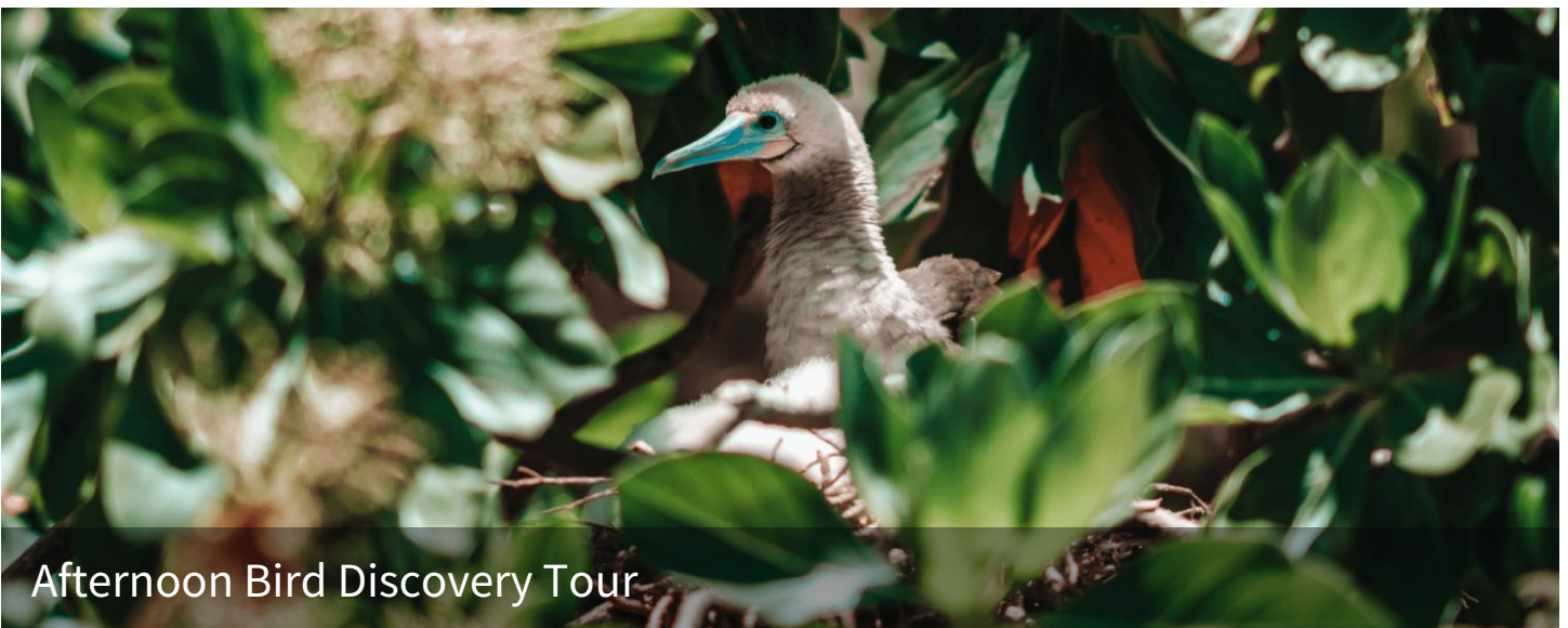
Afternoon Bird Discovery Tour

Tetiaroa is a special place for sea bird nesting and also a privileged observation place for ornithologists. Accompanied by the naturalists of the Tetiaroa Society's foundation, you will participate in collecting data on boobies, terns, noddies or egrets. You will discover the ornithological richness of the atoll of Tetiaroa during your excursion to various sites.