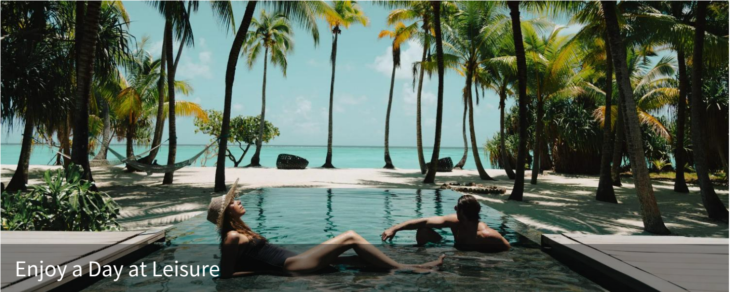
Enjoy a Day at Leisure