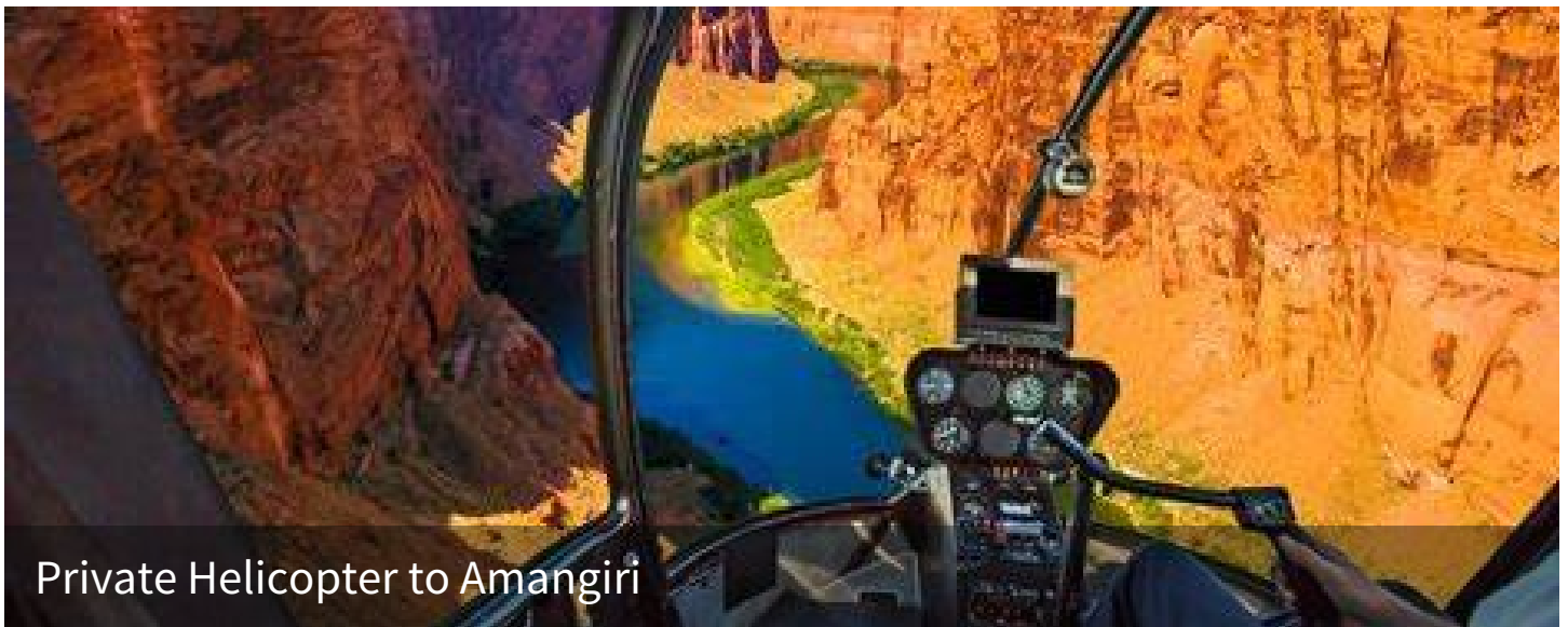
Private Helicopter to Amangiri

Upon finishing the Grand Canyon hike and chef's lunch, board the private helicopter to Amangiri. Approximate flight time is 45 minutes.