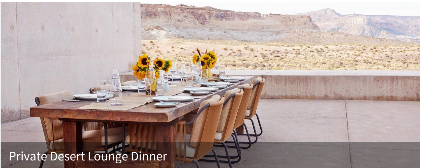
Private Desert Lounge Dinner