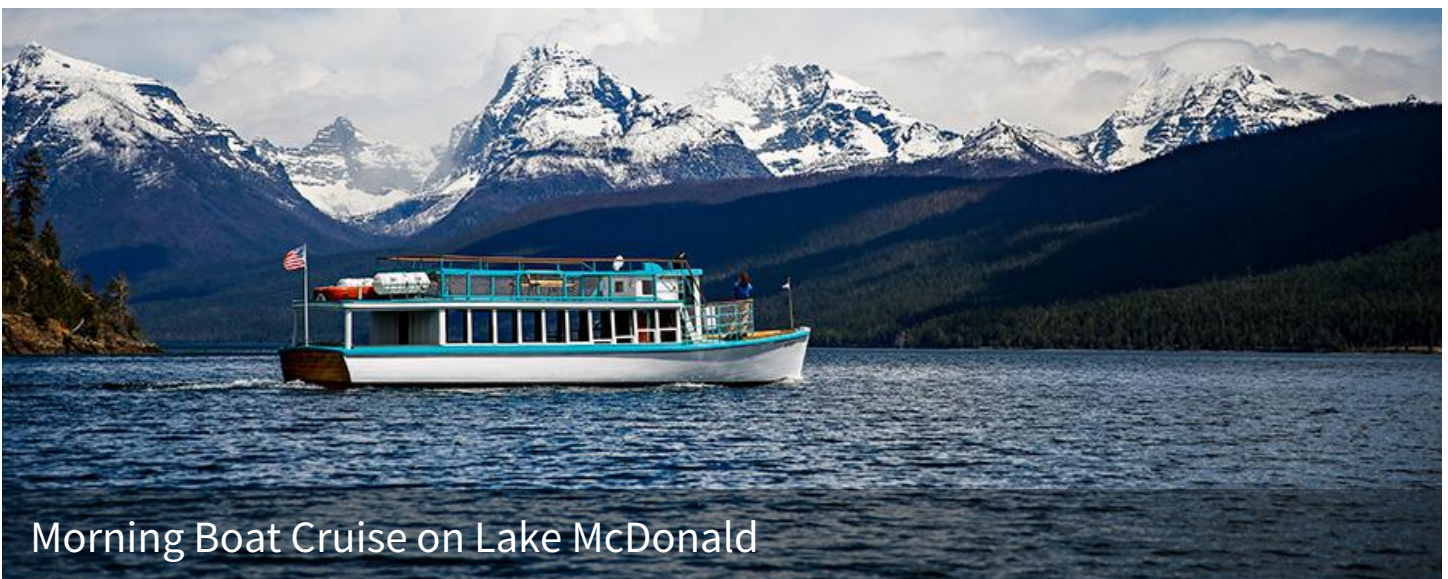
Morning Boat Cruise on Lake McDonald

Enjoy a morning scenic boat cruise on Lake McDonald on the historic vessel, DeSmet, the flagship vessel in Glacier National Park's wooden boat fleet. On this one-hour scenic cruise, you will have tranquil views of the west side of the park as well as the Continental Divide as you cruise along the emerald-hued lake, the largest in the park.