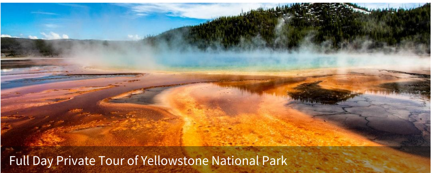
Full Day Private Tour of Yellowstone National Park