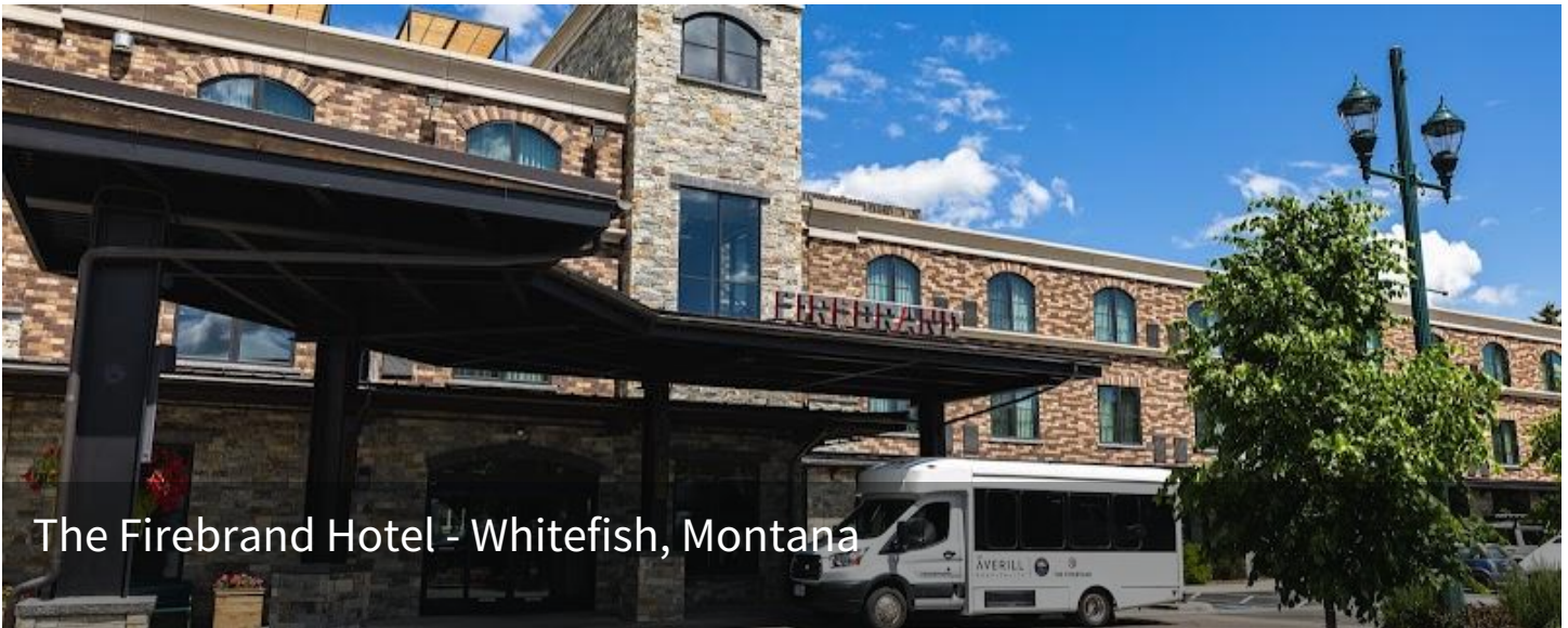
The Firebrand Hotel - Whitefish, Montana