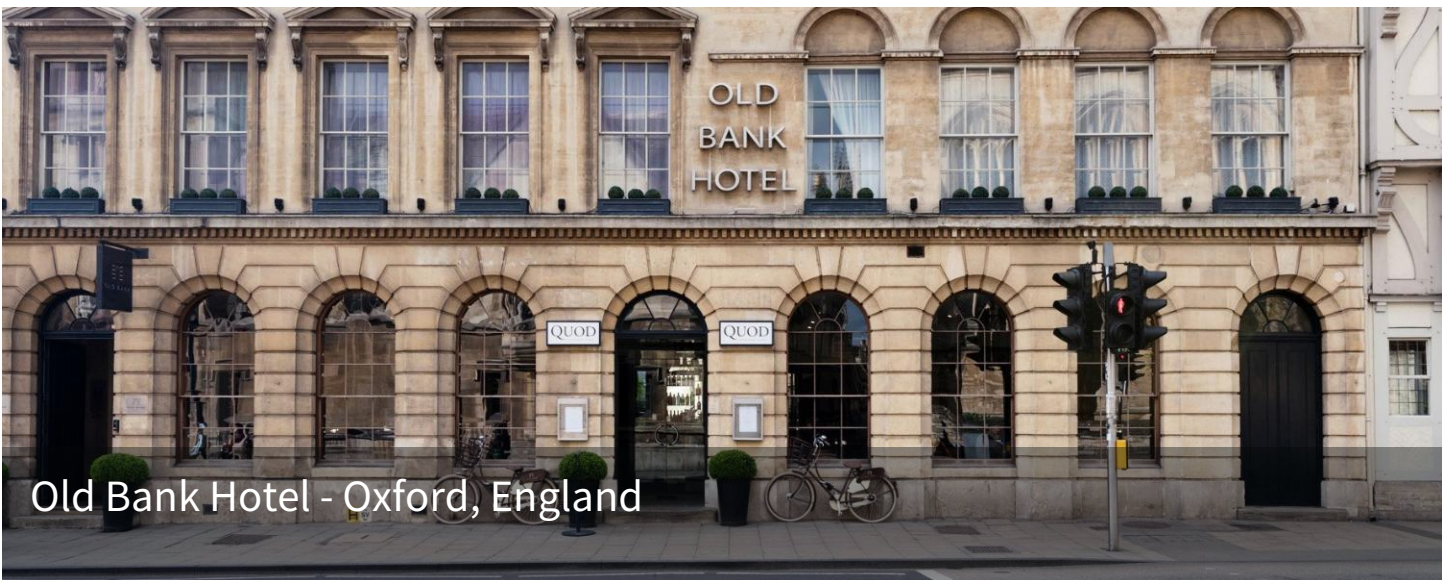
Old Bank Hotel - Oxford, England