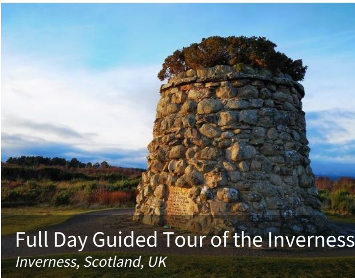
Full Day Guided Tour of the Inverness Area Inverness, Scotland, UK