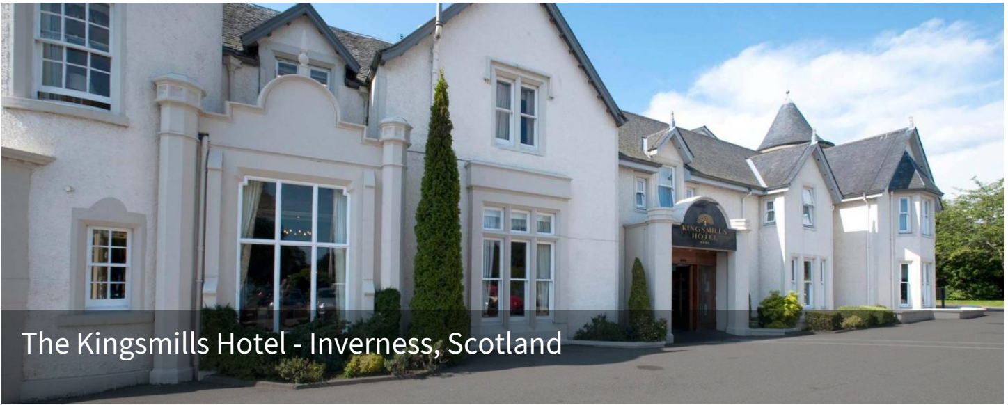
The Kingsmills Hotel - Inverness, Scotland

Continuing north, you will now drive along the famous Loch Ness. With over 1,000 eye-witness accounts of sightings of the Loch Ness Monster, keep your eyes peeled! Here on the loch, you will also visit the ruins of photogenic Urquhart Castle, where the remains include a tower house that commands splendid views of the loch and Great Glen.